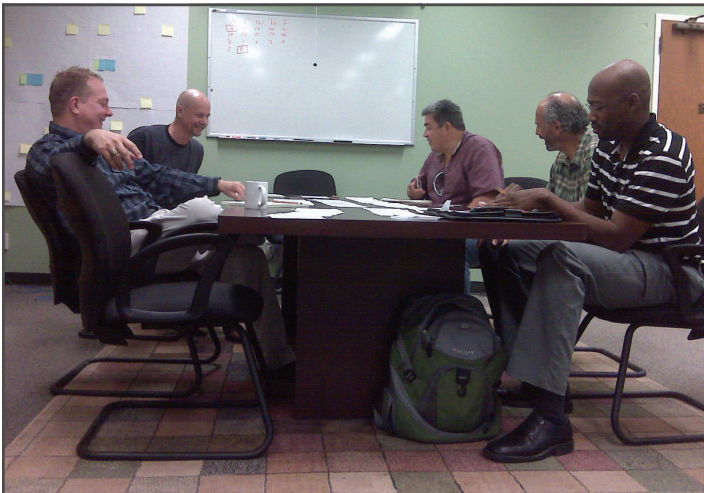
Members of the TDL technical team at work on TxLOR

The TDL technical team continued work on a number of development fronts, including the Texas Learning Object Repository (TxLOR), the Vireo electronic thesis and dissertation system, and PresNet.